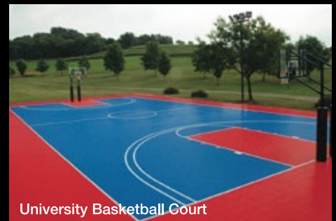
University Basketball Court

MADE IN THE USA, PLAYED ON AROUND THE WORLD