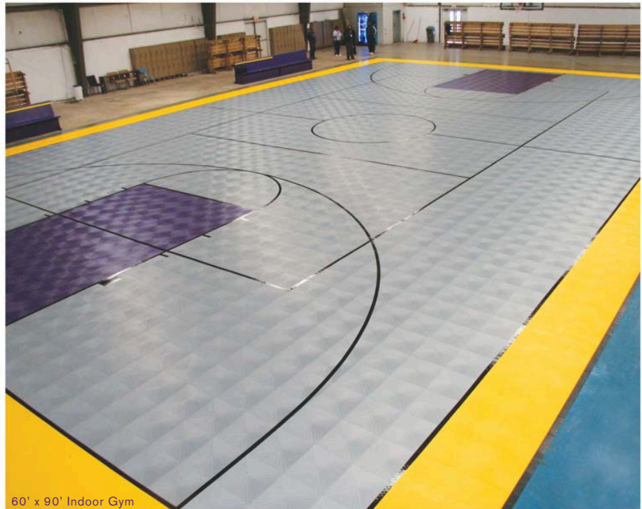
60' x 90' Indoor Gym