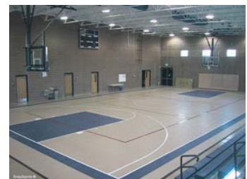
56' x 100' Indoor Gym Floor