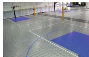
90' x 100' Indoor Gym Floor